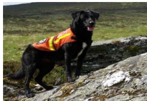
Search and Rescue Dogs